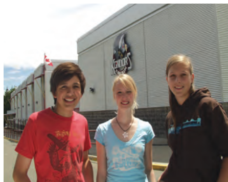
International students “putting in” at Tribune Bay