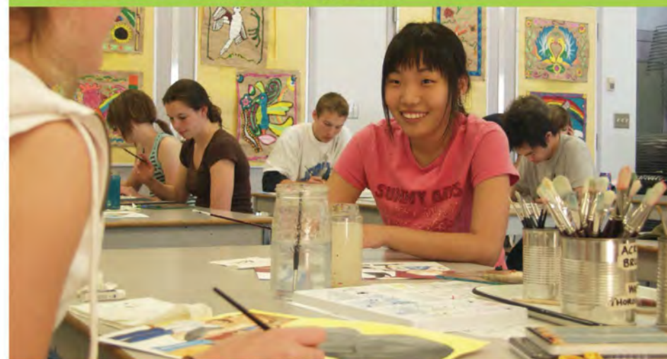
Studio Arts 12: Drawing and Painting Course

AT SCHOOL - Vocal Jazz • Concert Band • Jazz Band • Musical Theatre • Computer Animation • Dance Focus Program